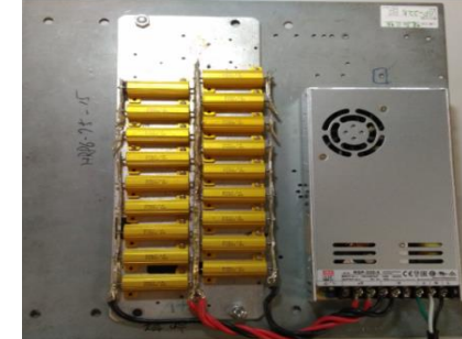
Figure 2 : Example of Test Setup